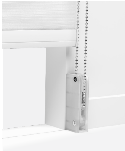
Flex Chainhold Deluxe Bracket Floor Fix

The deluxe bracket offers additional residential and commercial mounting options with a more rigid form factor on a floor mount for floor-to-ceiling installations.