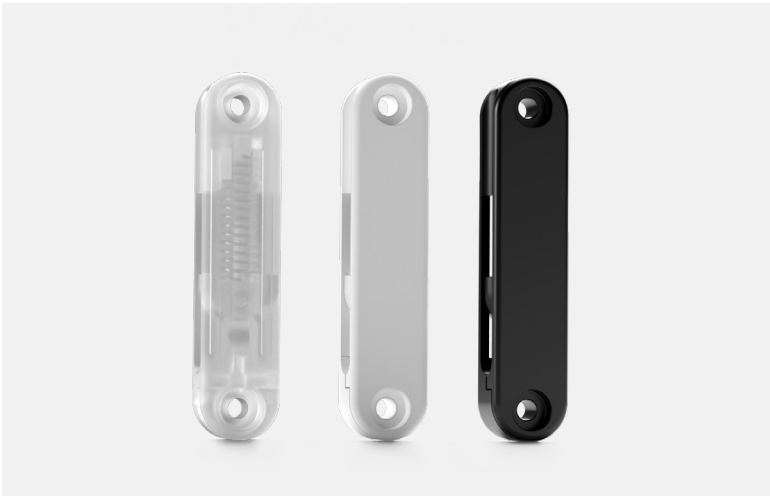
Flex Chainhold (frosted clear, white and black)