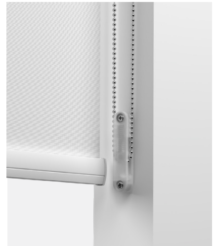
Flex Chainhold Adhesive Bracket Recess Fix

Perfect for commercial spaces where hardware is not permitted, the adhesive backed recess mount option provides a safe and dependable installation without the need for screws or drilling.