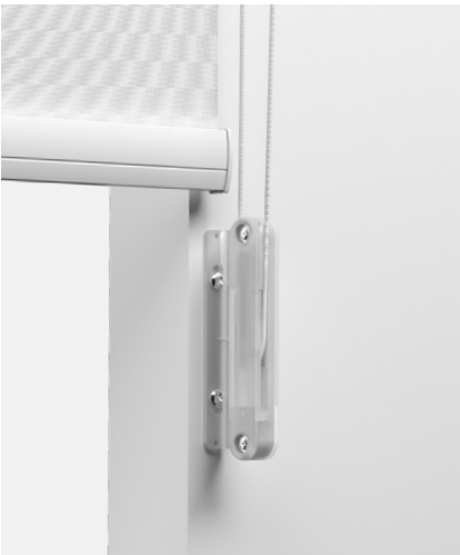
Flex Chainhold and Cordhold Face Fix Universal Bracket

The Flex Chainhold and Cordhold can be paired with their respective universal mounting brackets, offering a fast and easy face fix installation, ideal for residential environments.