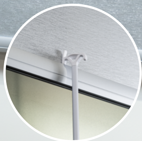
Pull Stick For hard to reach shades

Experience the convenience of Rollease Acmeda's user friendly spring operated roller shade solutions, which feature sleek aesthetics and eliminate the need for free hanging cords or chains.